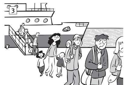
3 The passengers _____ the ship.