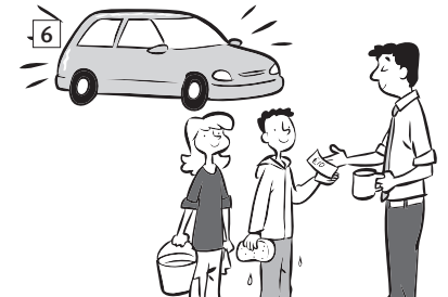
6 The children _____ the car.