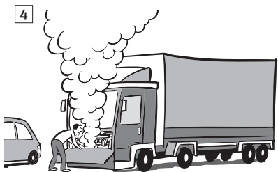
4 The lorry _____.