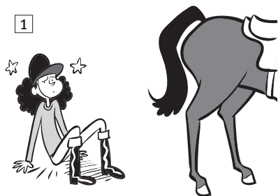
1 She _____ her horse.

break down fall off finish get off land leave pass wash