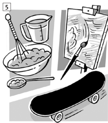
dangerous / quiet / relaxing