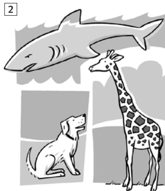
tall / fierce / scary