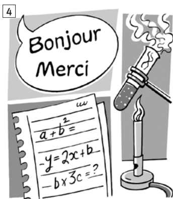
useful / hard / exciting