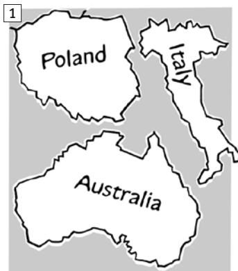
large / hot / expensive

C Work in pairs. Compare the things in each picture. Use the comparative and superlative forms of the adjectives.