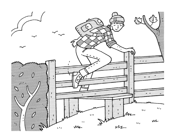
Work in pairs. Ask and answer the questions from taskB. Remember to give as much information as possible!